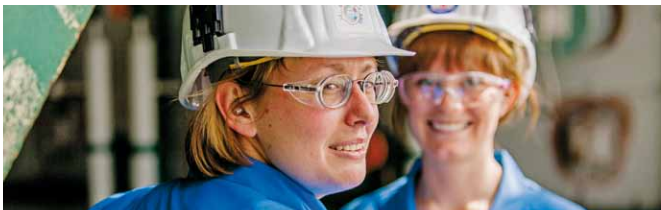
Employees of Antwerp refinery, Belgium.