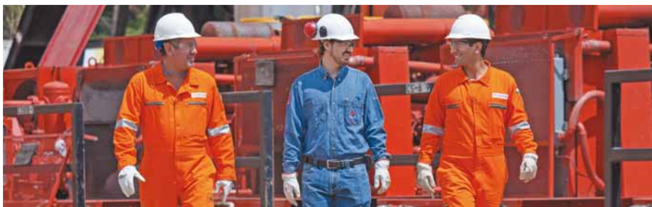
Employees of Incahuasi project, Bolivia.

This proposal is related to the implementation of a loyalty dividend for holders of registered shares for more than two years in conformity with Article L. 232-14 of the French Commercial Code. Pursuant to this Article, a loyalty dividend can be allotted by a company to its shareholders within the limits of 10% of the paid dividend and 0.5% of the company share capital for the same shareholder. At the end of fiscal year, shareholders shall own registered shares for at least two years and until the date on which the dividend is paid but to the extent that such provision is stated in the articles of association of the company. In addition, pursuant to such Article, this loyalty dividend cannot