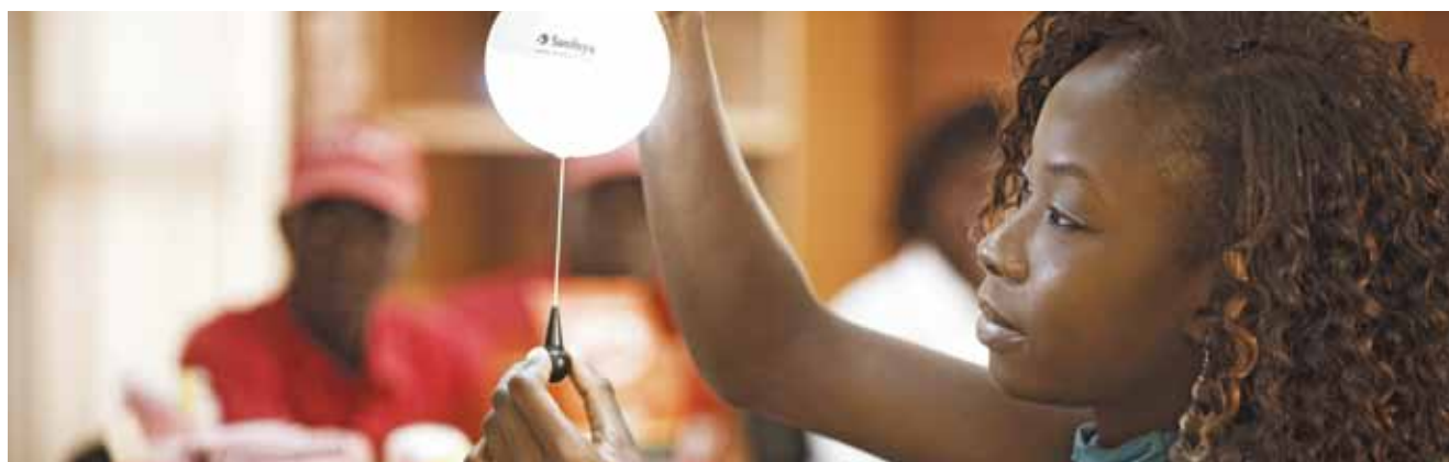
Awango lamps sales training, Burkina Faso.

Upon presentation of the report of the Board of Directors and the Auditors' special report, and voting under the conditions of quorum and majority required for Extraordinary General Meetings, pursuant to the provisions of Article L. 225-135-1 of the French Commercial Code, the shareholders hereby delegate authority to the Board of Directors, with the option to