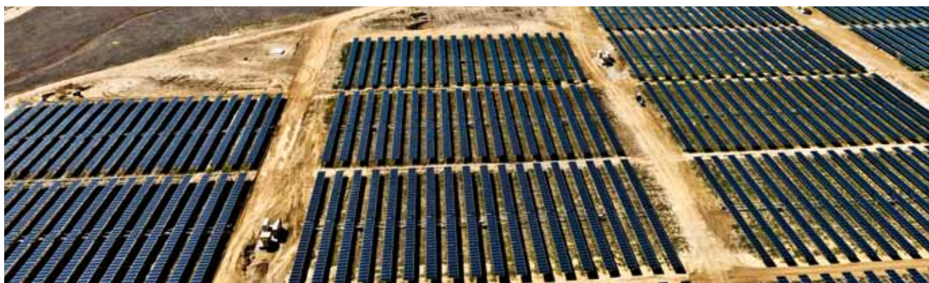
Solar panels developed by SunPower Corp., California Valley Solar Ranch, USA.

Pursuant to the provisions of Article L. 225-209 of the French Commercial Code, the maximum number of Company shares that may be repurchased under this authorization may not exceed 10% of the total number of outstanding shares of the Company's share capital on the date of the operation. Such repurchases may not at any time cause the Company to hold, directly or indirectly through its subsidiaries, more than 10% of its share capital.