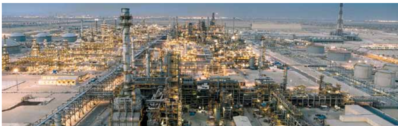
Satorp refinery in Jubail, Saudi Arabia.

Three interim dividends of €0.59 per share were paid on September 27, 2013, December 19, 2013 and March 27, 2014, respectively. The remaining balance of €0.61 per share for the 2013 fiscal year shall be detached from the share listed on Euronext Paris on June 2, 2014 and paid in cash on June 5, 2014.