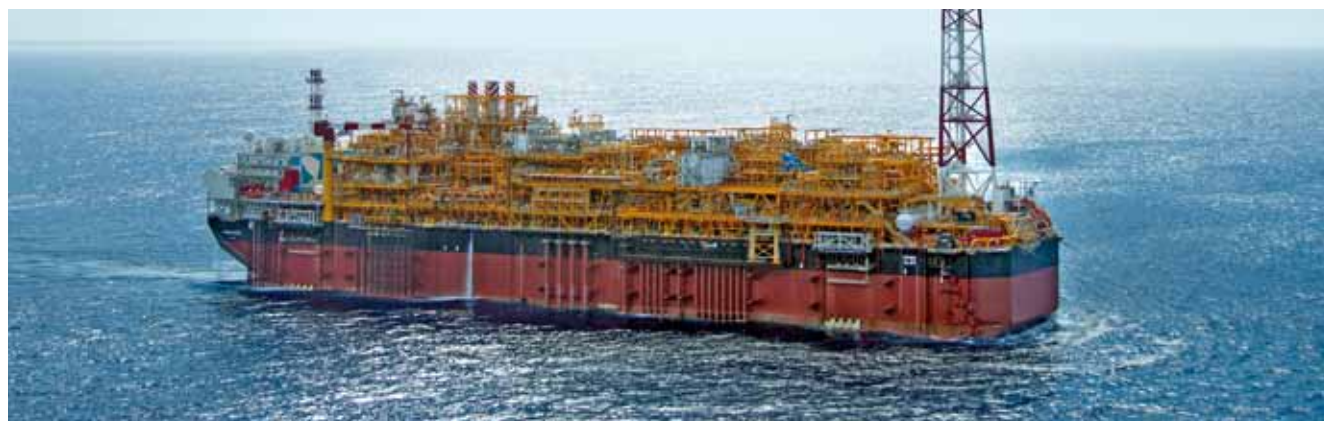
CLOV project FPSO (Floating Production Storage and Offloading unit), Angola.