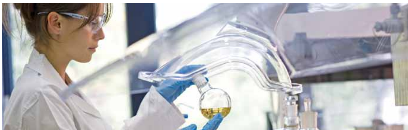
Technician of the liquid chromatography laboratory of the Centre Scientifique et Technique Jean Féger, Pau, France.