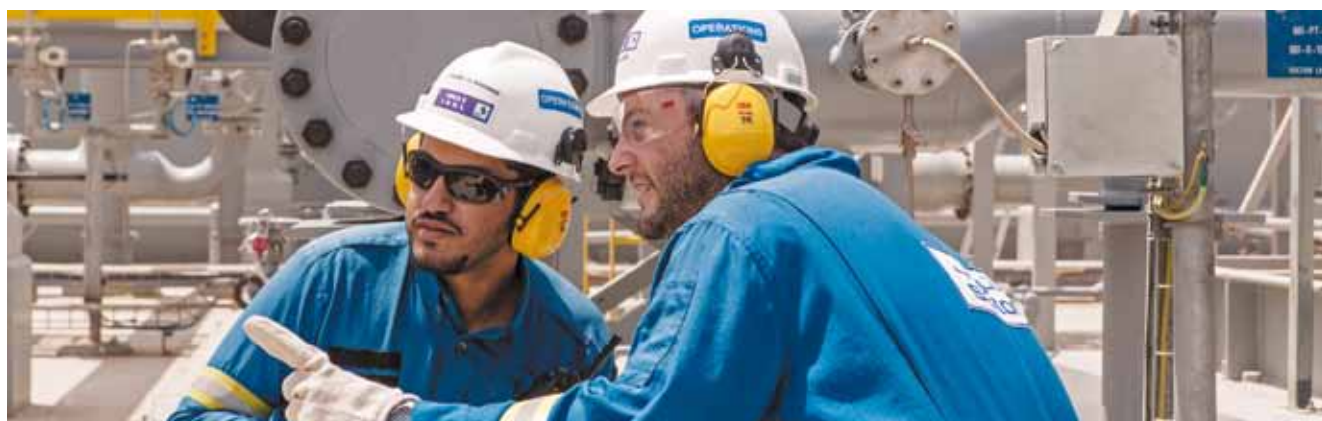
Employees of Satorp refinery in Jubail, Saudi Arabia.

As a consequence, the Board decided not to approve this resolution.