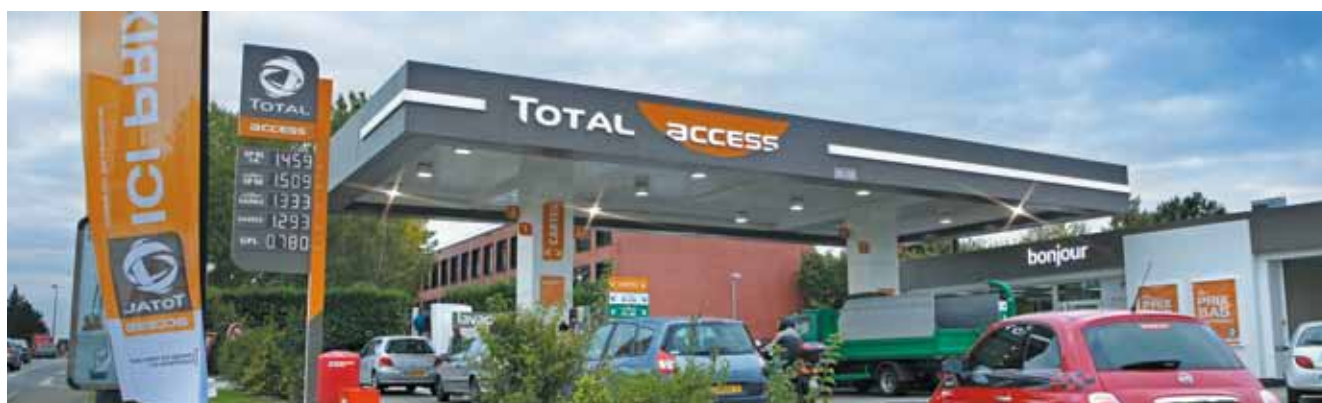
Total Access service station in Rocquencourt, France.

It is proposed, in the ninth resolution , pursuant to Article 24.3 of the AFEP-MEDEF Code of Corporate Governance to which the Company voluntarily refers, that you give a favorable opinion on the elements of compensation due or granted for the fiscal year ended December 31, 2013 to Mr. Christophe de Margerie, Chairman and Chief Executive Officer of the Company, as described in the summary table hereafter.